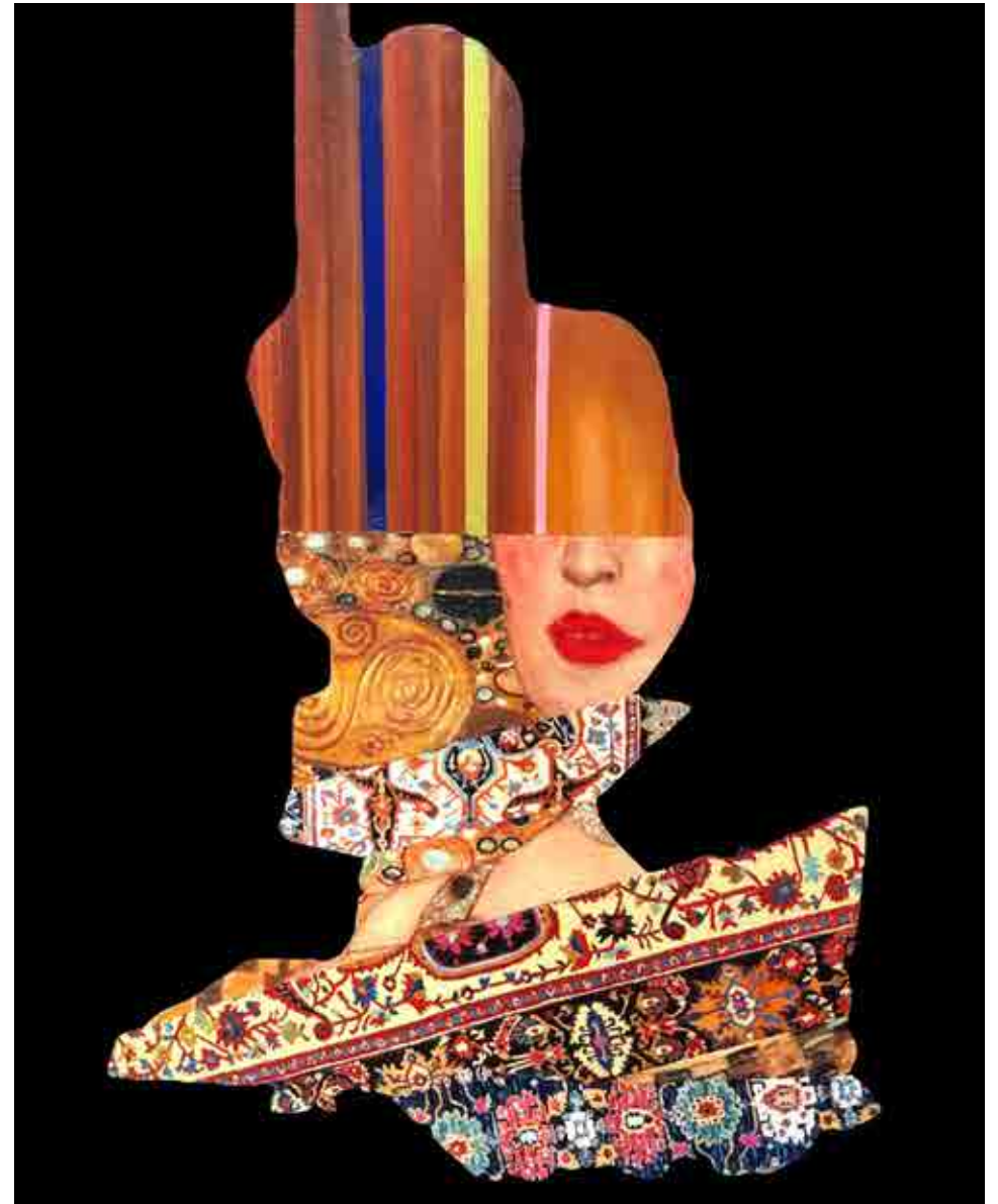
Golden Lady (after Klimt ), 2019 Oil on canvas 18x18 inches Courtesy of the artist