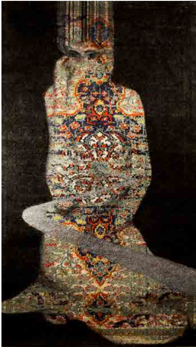
Grey Gaze, 2017 Acrylic on carpet 54x36 inches