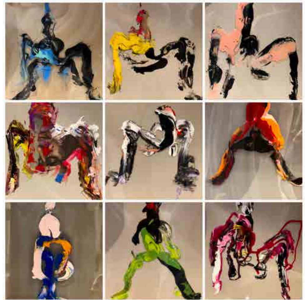
Essence in Pose, 2018-2019 Acrylic on archival film 11x9 inches each