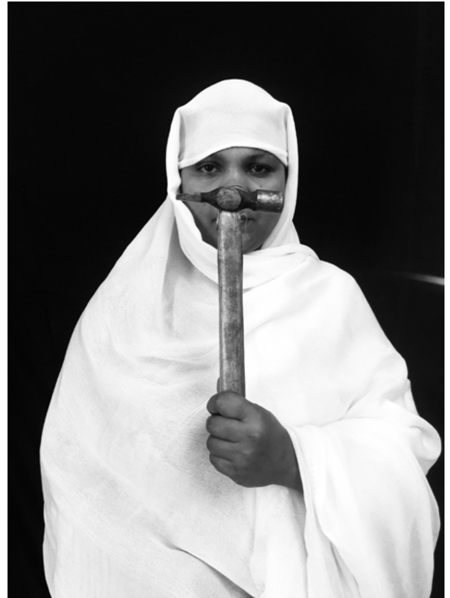
Her Hammer, 2016-2017 B/W photograph in a light box, edition of 3 17x11 inches