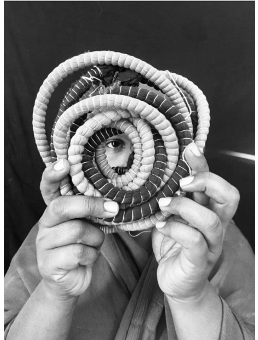
Gaze from Veil (Dupatta), 2016-2017 B/W photograph in a light box, edition of 3 17x11 inches