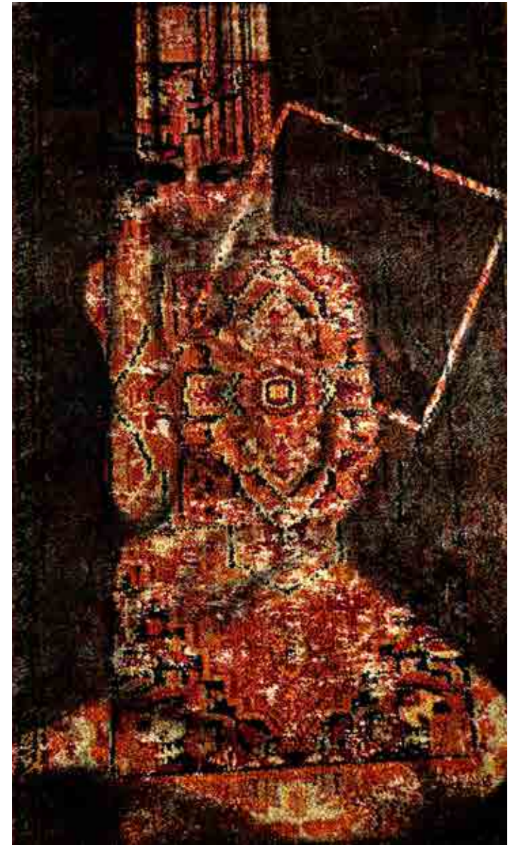
Red Gaze, 2017 Acrylic on carpet 54x36 inches