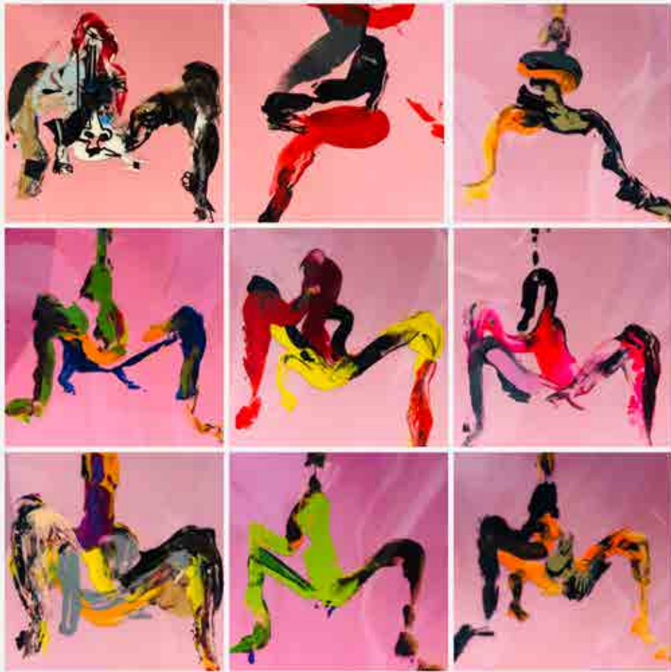
Essence in Pose, 2018-2019 Acrylic on archival film 11x9 inches each