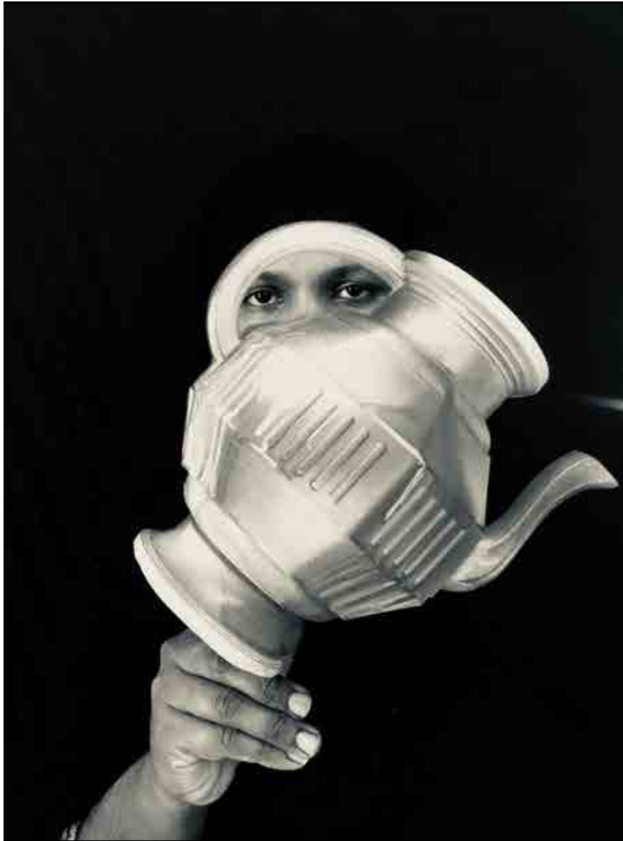
Female Gaze , 2016-2017 B/W photograph in a light box, edition of 3 17x11 inches Courtesy of the artist