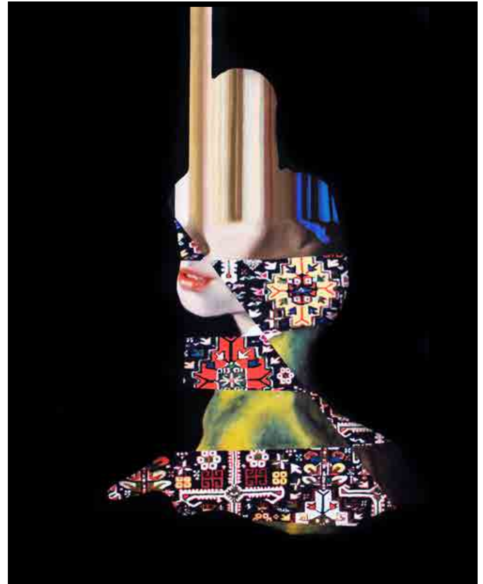
Girl with a Persian Earring (after Vermeer), 2017 Oil on canvas 36x24 inches