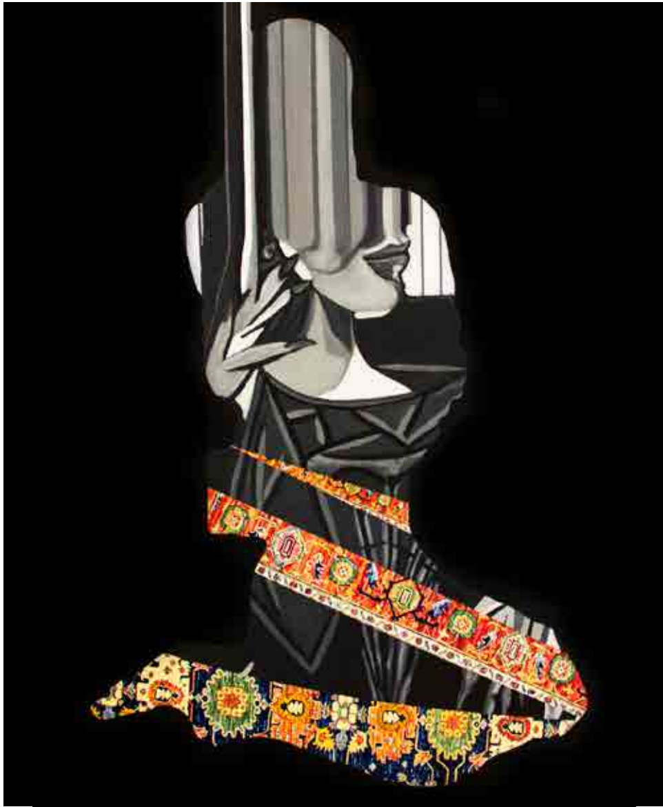
Dora's Lips (after Picasso), 2017 Oil on canvas 36x24 inches