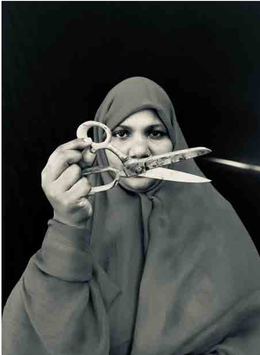
Cut it Up, 2016-2017 B/W photograph in a light box, edition of 3 17x11 inches